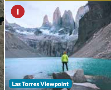
Las Torres Viewpoint